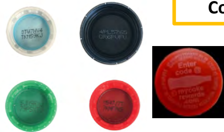
Coca-Cola brand bottle tops with codes inside.